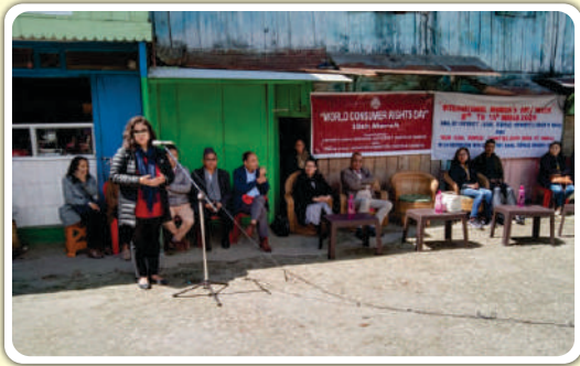
Lall Bazaar, Ravangla