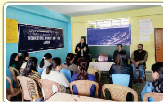
Tasa Tengay Sr. Sec. School, Chungthang