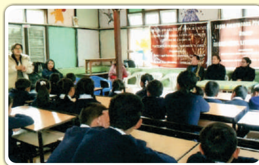
Government Junior High School, Pangthang