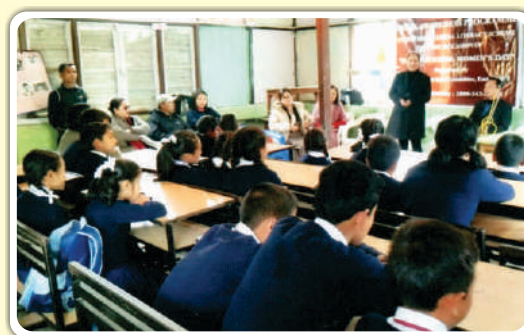
Government Junior High School, Pangthang