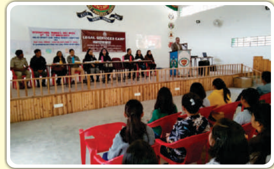
Government Sr. Sec. School, Kewzing