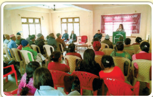
Gram Panchayat Unit, Tharpu, Soreng