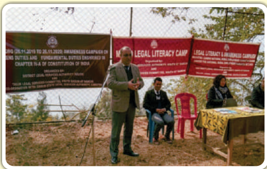
Government Junior High School, Vaishalgaon