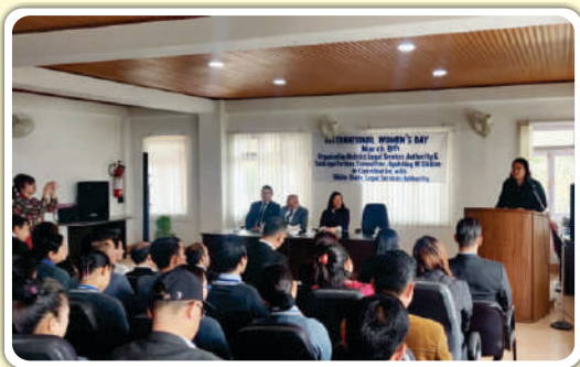
ADR Centre, Gyalshing