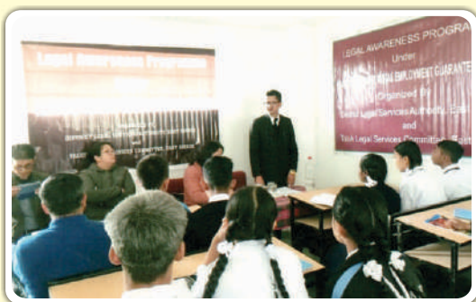
Government Secondary School, Chanatar