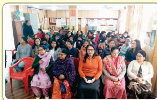
Directorate of Handicraft & Handloom Department, Zero Point, Gangtok.