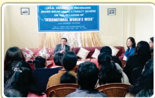
Mamtalaya, Lower Burtuk, Gangtok