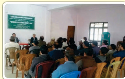
Kechuk Bhawan, Chandmari, Gangtok