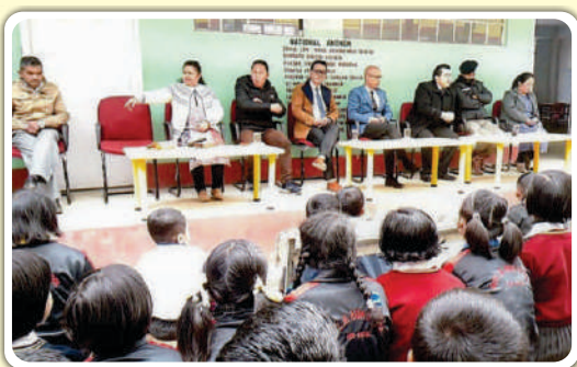
Government Junior High School, Hee-Patal