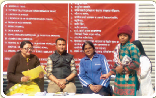
Singtam, East Sikkim