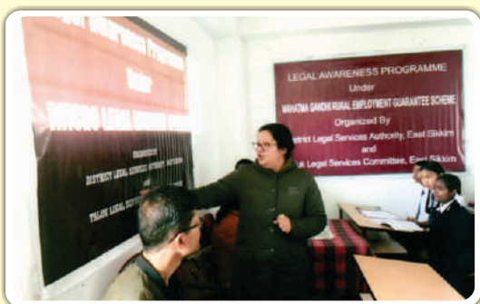
Government Secondary School, Chanatar