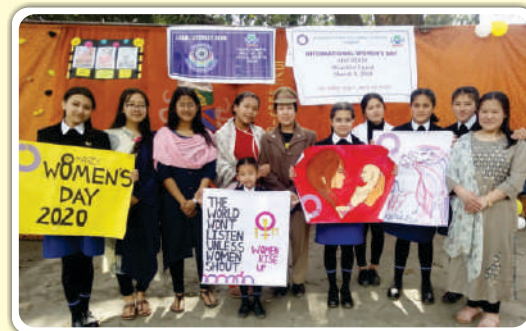
International Women's Day celebrated by Legal Literacy Club at Paljor Namgyal Girls Sr. Sec. School