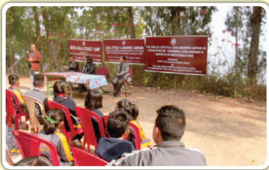
Government Junior High School, Denchung