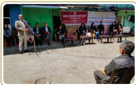
Ravangla Bazaar, South Sikkim