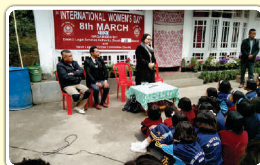
Mayal Lyang Children Home, Singithang