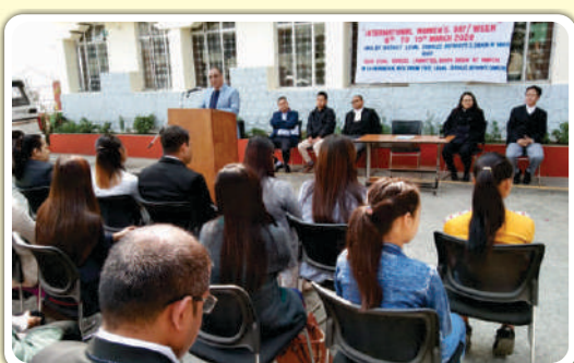
District Court Complex, Namchi