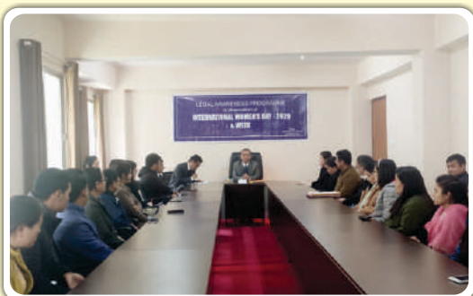
District Court Complex, Mangan