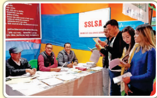
Jorethang, South Sikkim